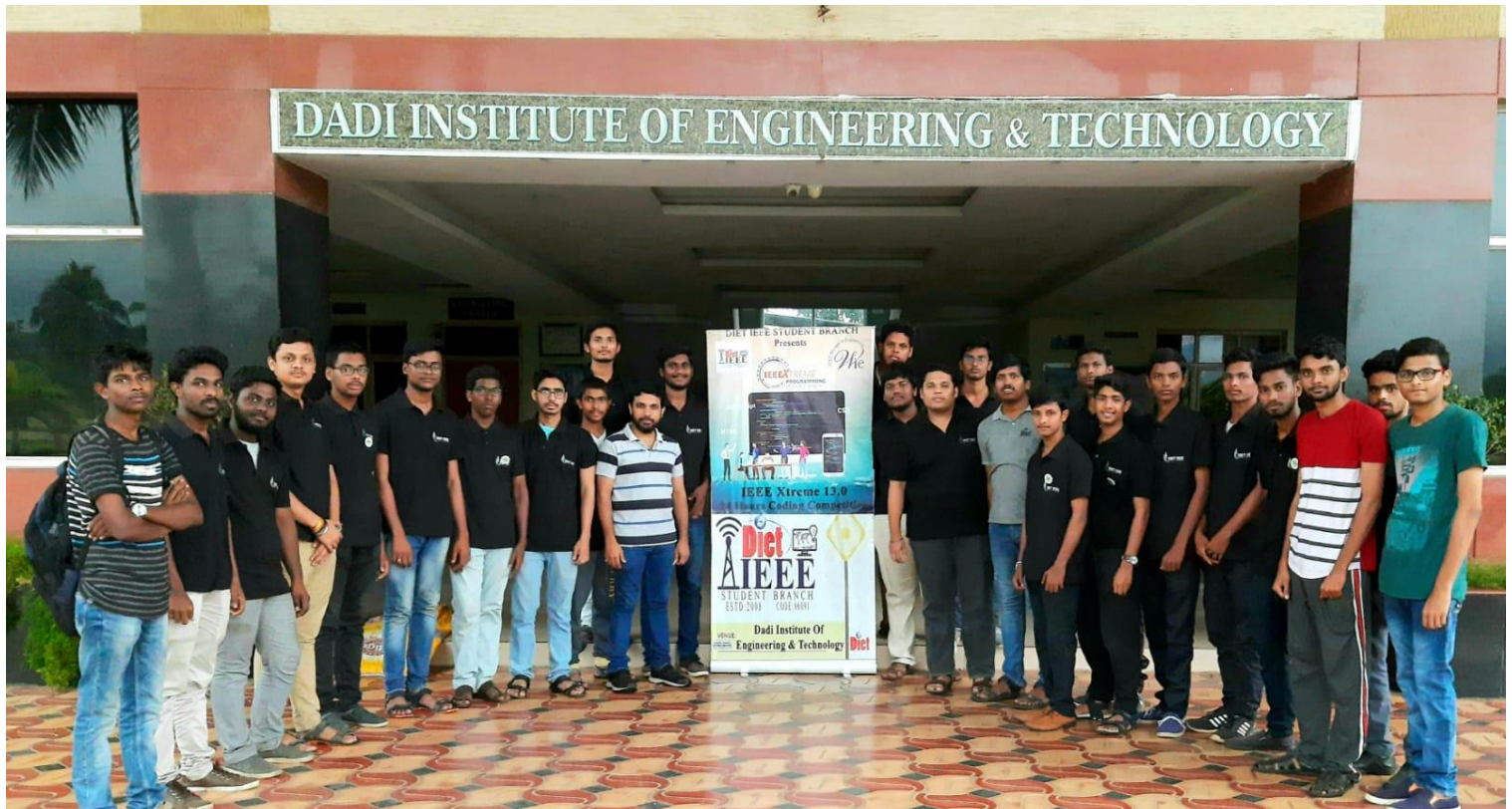
Successful completion of 24 hours of Xtreme 13.0