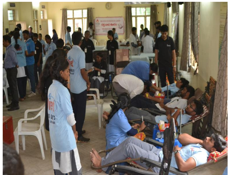
Volunteers Donating Blood during Blood Donation Camp