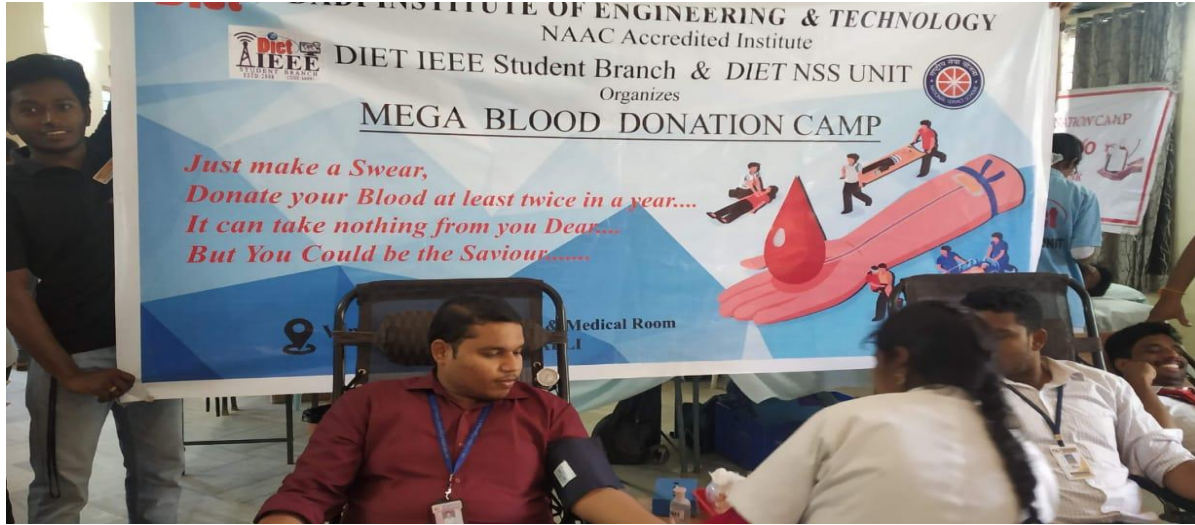
DIET IEEE SB Counselor Donating Blood