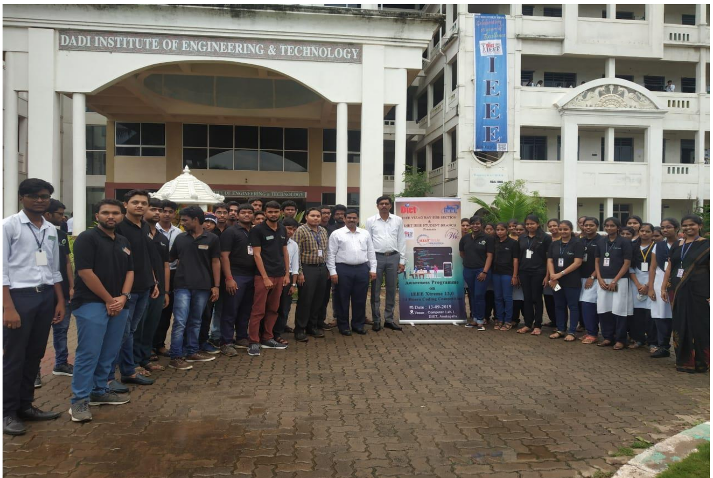
IEEE Members with Chief Guest